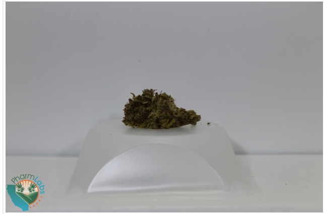
*Dry Weight %